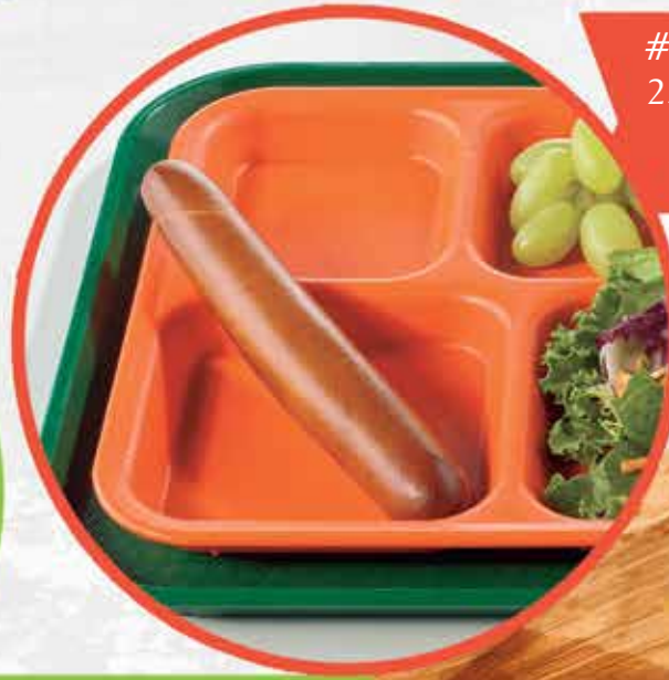
#9545 Bavarian Bakery® 2.0 oz 51% Whole Grain Soft Pretzel Stick 72 ct