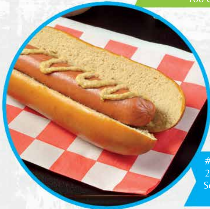
#9546 Bavarian Bakery® 2.6 oz 51% Whole Grain Soft Pretzel Hot Dog Roll 72 ct