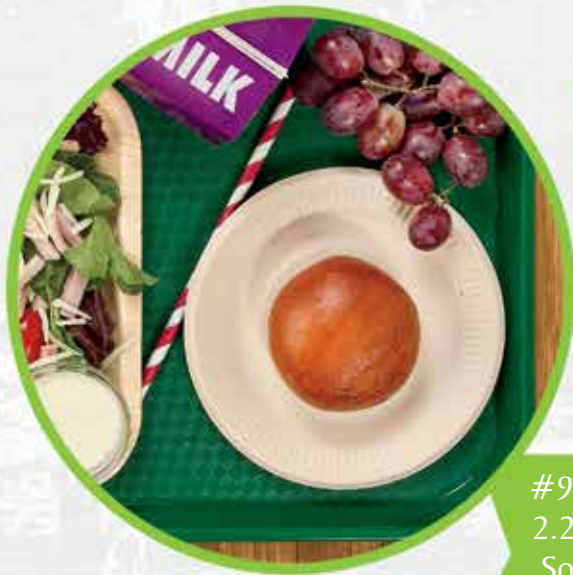
#9549 Bavarian Bakery® 2.2 oz 51% Whole Grain Soft Pretzel Dinner Roll 100 ct

Bring Restaurant Trends into Your Cafeteria