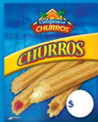
Price Sign (11" w x 14" h)