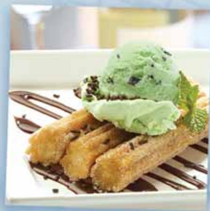
Chocolate Mint Churro