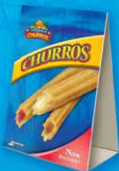
Table Tent (5" w x 7" h)