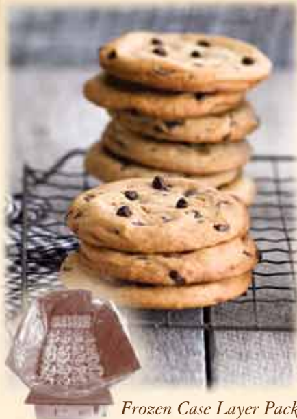
Frozen Case Layer Pack