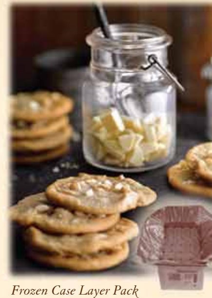
Frozen Case Layer Pack