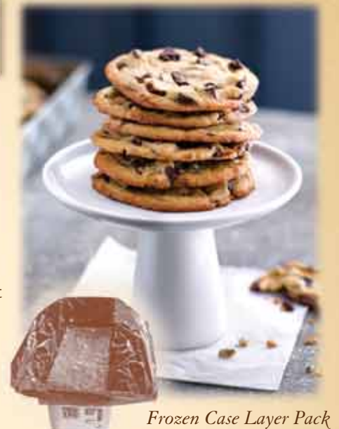
Frozen Case Layer Pack