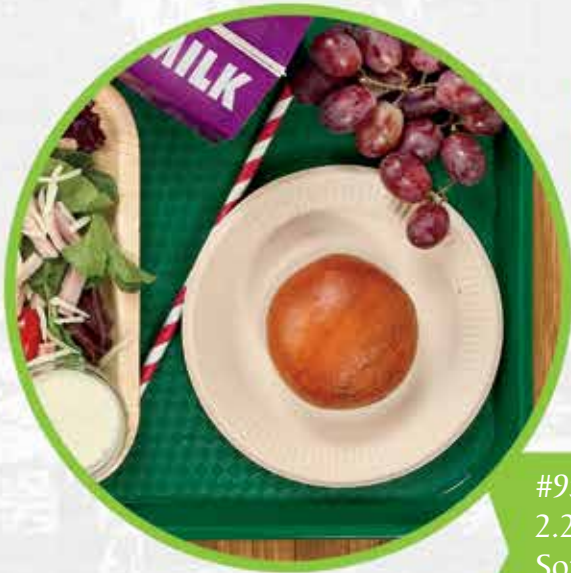
#9549 Bavarian Bakery® 2.2 oz 51% Whole Grain Soft Pretzel Dinner Roll 100 ct

Bring Restaurant Trends into Your Cafeteria