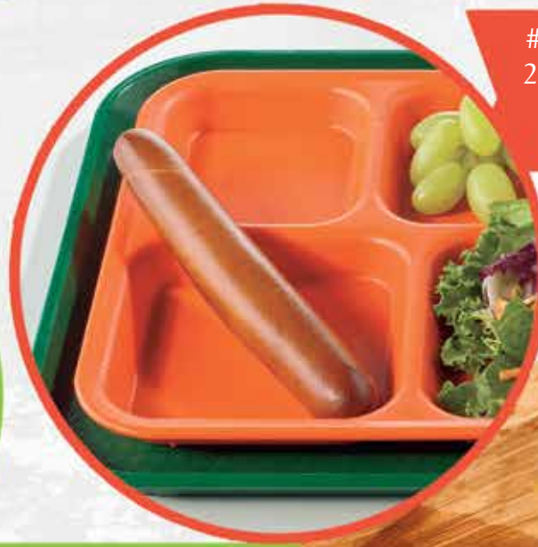
#9545 Bavarian Bakery® 2.0 oz 51% Whole Grain Soft Pretzel Stick 72 ct